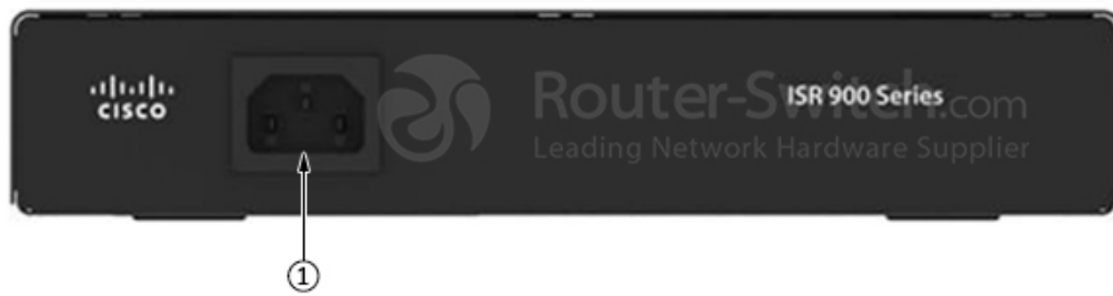
Figure 2 shows the back panel of C921-4P.